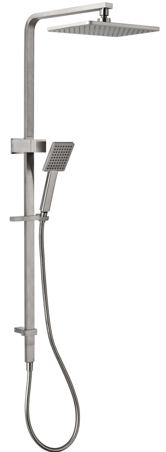
ECO Dual Rectangular Rail Shower HS125 Matte Black