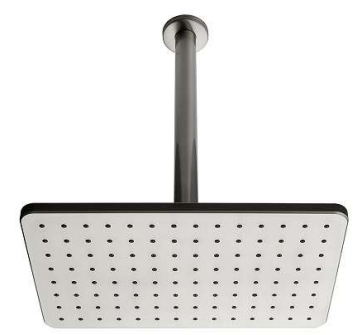
ECO Rain Shower Rectangular Ceiling Arm 300mm Black