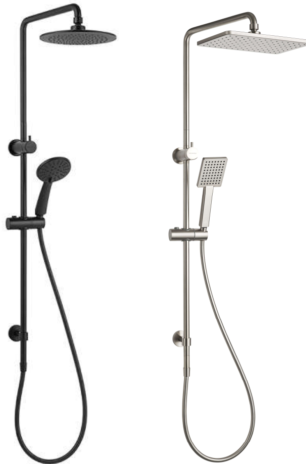
98752N New Style Chrome