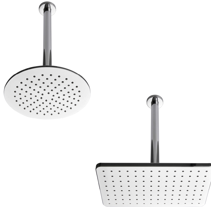
NEW 98032 style