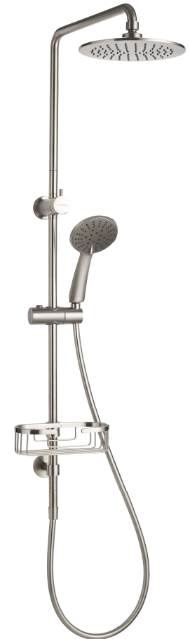
ECO Dual Elite Rain Shower Round HS375 Basket Matte Black